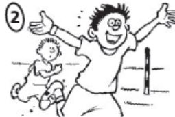
sad / proud