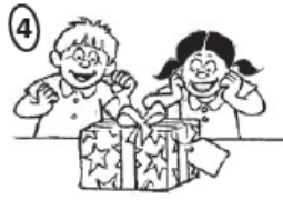
excited / angry