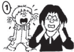
annoyed / happy