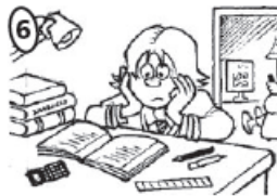
fed up / embarrassed